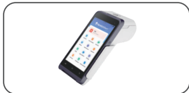
Cost-effective smart POS terminal.